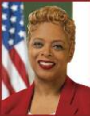
City Councilwoman Cindy Bass