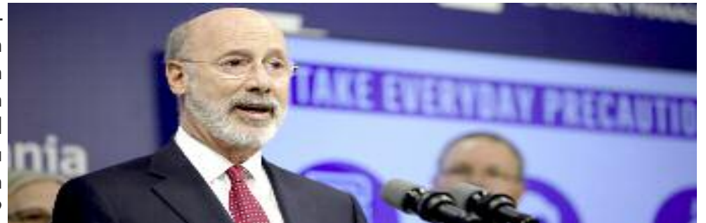
Governor Tom Wolf updating residents of PA about next steps to reopen the state

Pennsylvania Counties that have been in the yellow phase for the requisite 14 days have been closely monitored for the risk associated with transitioning to the green phase the yellow phase