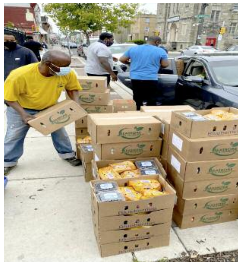
This is where the food collection begins, at the AWF Commu