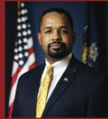
State Senator Sharif Street