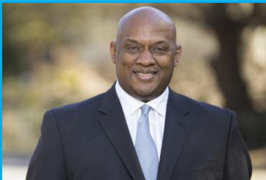
Congressman Dwight Evans

substantial economic impact payments of $1,200 per family member, up to $6,000 per household.