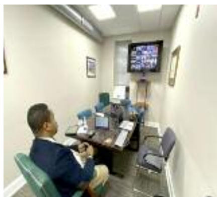
Senator Street participating in 1st ever Virtual PA Senate voting