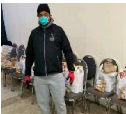
Senator Street using his Germantown Office as food distribution center