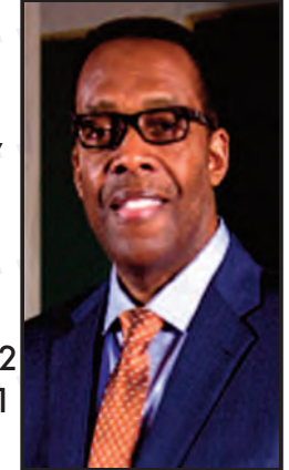
Philadelphia City Council President Darrell Clarke