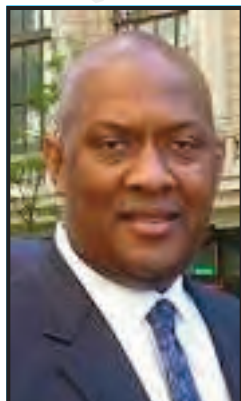
Congressman Dwight Evans

District Office 7174 Ogontz Avenue Philadelphia, PA 19138