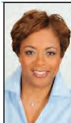
City Councilwoman Cindy Bass

District Office 4439 Germantown Ave. Philadelphia, PA 19140