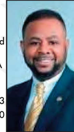
City Councilman Curtis Jones, Jr.

District Office 5300 Wynnefield Ave. Philadelphia, PA 19131