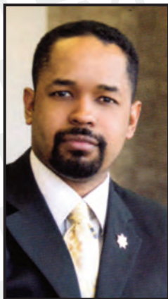
PA State Senator Sharif Street, Esq.

District Office 1621 W. Jefferson Street Philadelphia, PA 19121