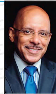
PA State Senator Vincent Hughes

District Office 2401 N. 54th Street Philadelphia PA 19131