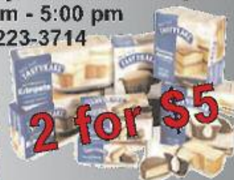
Tastykake Family Packs