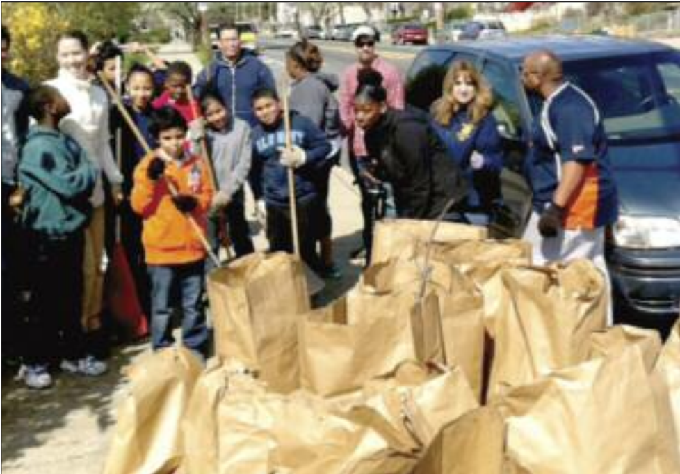
Pictured see residents from 3300 block of W. Allegheny and from that immediate area, who participated in Spring Clean Up April 5th.

helped potential customers see that North 22nd Street was a shopping district that held various goods and services. The key in surviving economy changes is too work together in business, "if you try to do this own your own, you stand on your own island, but if you get other people to join you in this advertisement venture you get forward thinking," said Little. Customers flowed in and out of the small cramped women's clothing store that was also used as a travel notary, positioned in the front of the store. Filled with the last selection of winter sweaters, children's clothing, women's accessories and clothes, Fe-Male Fashion Discount Appeal attracted a wide-range customer base. "Retaining customers and customer