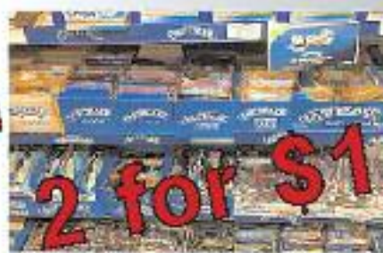
Tastykake 2 Pack Single Serve