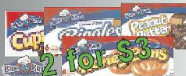
Blue Bird Family Packs