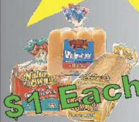
Nature's Own Bread