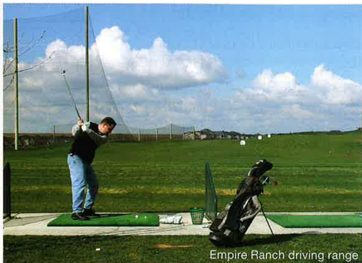
Empire Ranch driving range