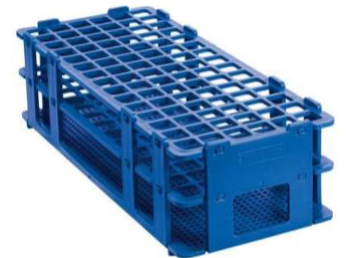
No-Wire Test Tube Rack