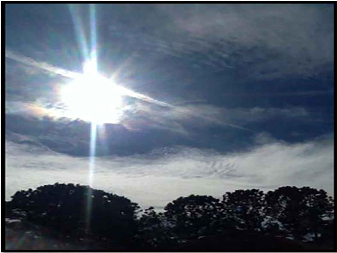
Demonic Watcher in the Daytime Sky

“For it is written and forever remains written, ‘He will command His angels concerning You to guard and protect You,’” (Luke 4:10).