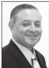
Leon Funeral Director