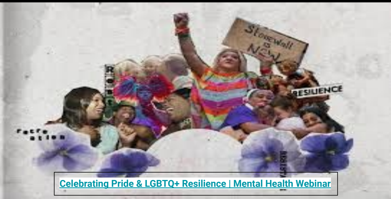
Celebrating Pride & LGBTQ+ Resilience | Mental Health Webinar