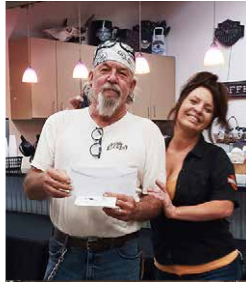
Disco won the "Loser Baby" worst hand for $50