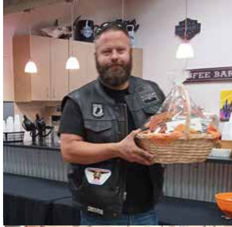
Shaggy won the 50/50 for $135 ~ Then donated it to a local Veteran in need.