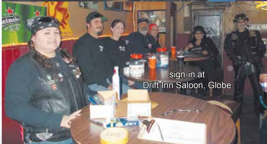
sign-in at Drift Inn Saloon, Globe