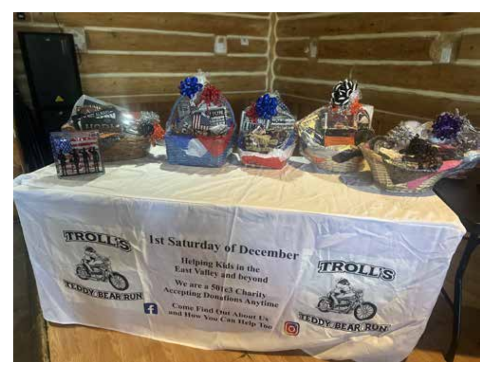
continues on page 8

The 60+ riders headed out, took Sossaman to University, went west to Hwy 87, then off to Fountain Hills where they