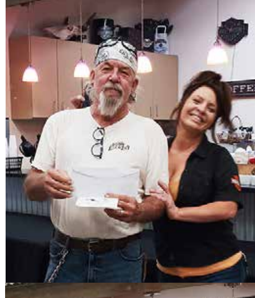
Disco won the "Loser Baby" worst hand for $50