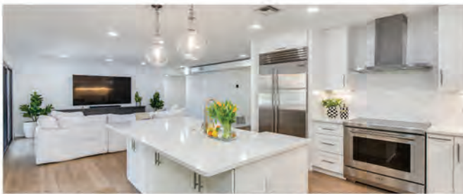
ANOTHER SOLD IN BILTMORE GREENS 3116 E Rose Ln, Phoenix, AZ 85016

Call today for access to our latest off-market properties.