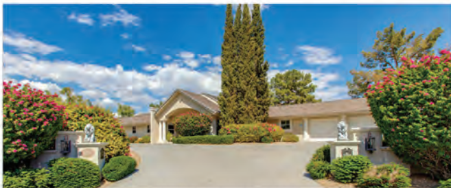
ANOTHER SOLD IN BILTMORE ESTATES 87 Biltmore Est, Phoenix, AZ 85016