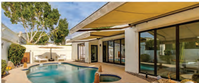
ANOTHER SOLD IN BILTMORE GATES 2737 E AZB Circle #29, Phoenix, AZ 85016