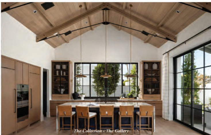
The Collection - The Gallery

The Gold Nugget Awards is the largest and most prestigious competition of its kind in the nation. It honors design and planning achievements in community and home design, green-built housing, site planning, commercial, retail, mixed-use development, and specialty housing categories. Gold Nugget Awards recognizes those who improve our communities through exceptional concepts in design, planning, and development.