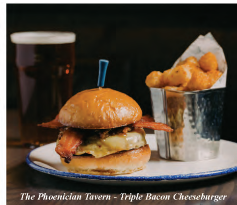
The Phoenician Tavern - Triple Bacon Cheeseburger