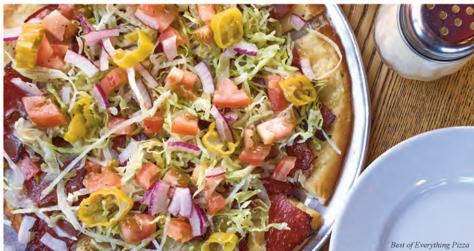
Best of Everything Pizza