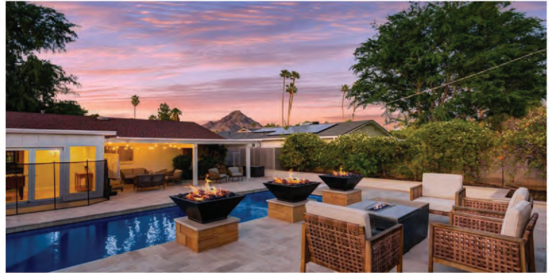
1831 E Rovey Ave, Phoenix, AZ 85016 4 Bed | 3.5 Bath | TONKA VISTA