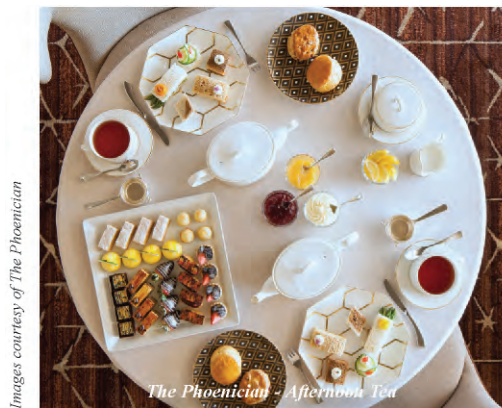
The Phoenician - Afternoon Tea

The Phoenician is located at 6000 E. Camelback Road in Scottsdale. Complimentary parking is included for all guests dining at The Phoenician. ❖