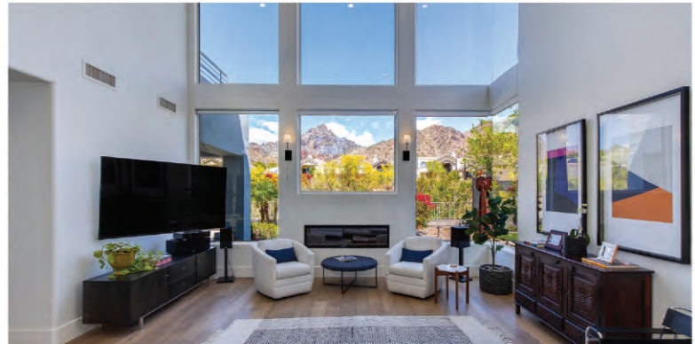
3042 E Squaw Peak Cir, Phoenix, AZ 85016 3 Bed | 3 Bath | BILTMORE HILLSIDE VILLAS