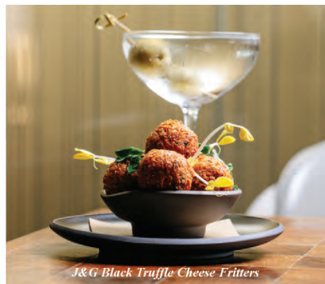
J&G Black Truffle Cheese Fritters