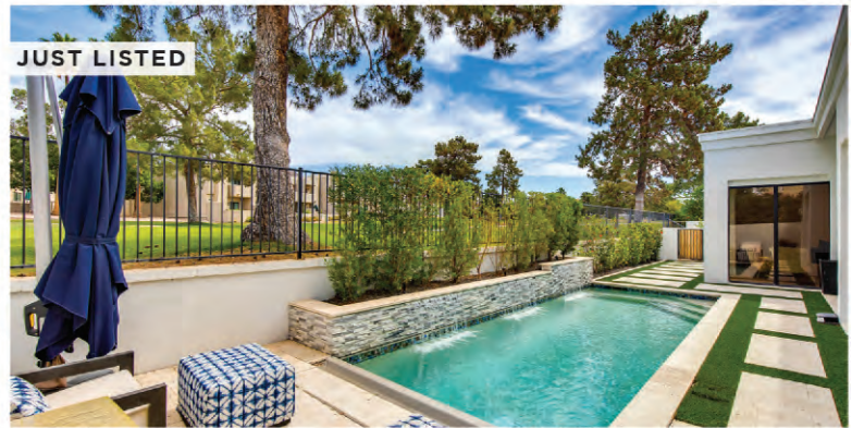
2737 E AZB Circle #8, Phoenix, AZ 85016 3 Bed | 3 Bath | BILTMORE GATES