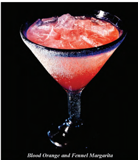
Blood Orange and Fennel Margarita

The Mexicano brings elevated, chef-driven Mexican cuisine and high-energy dining to Phoenix and now the East Valley in Chandler. Known for its build-your-own margarita bar and vibrant fiesta atmosphere, The Mexicano blends authentic Mexico City flavors with playful fusion dishes like birria bao buns and guacamole Ferris wheels. With daily DJs, fire dancers, and Mariachi performances, both locations deliver a bold, interactive experience seven days a week. The Mexicano's original location is at 4801 E. Cactus Road in Phoenix, and its newest location can be found at 3095 W. Chandler Boulevard in Chandler. For more information, please visit www.themexicano.com . ❖