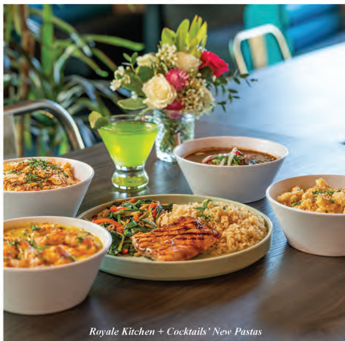
Royale Kitchen + Cocktails' New Pastas