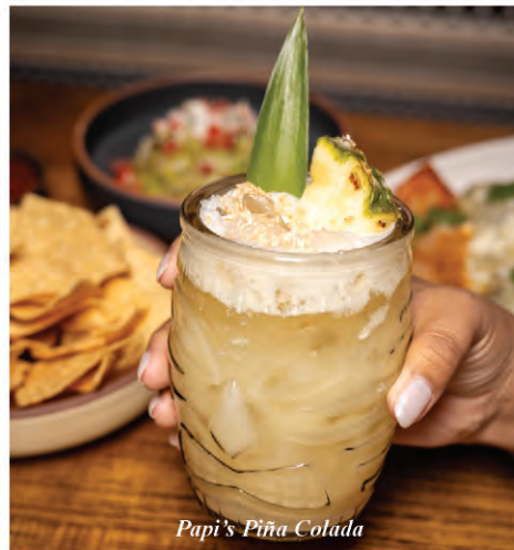
Papi's Piña Colada