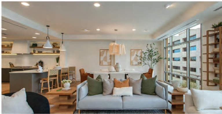
2211 E Camelback Rd #402, Phoenix, AZ 85016 2 Bed | 3 Bath | RESIDENCES AT 2211 CAMELBACK