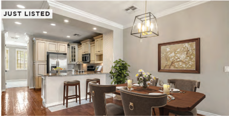
4401 N 24th Pl, Phoenix, AZ 85016 3 Bed | 3.5 Bath | BILTMORE JEWEL