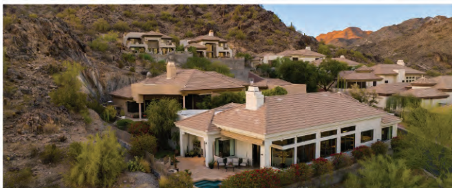
JUST LISTED IN BILTMORE HILLSIDE VILLAS 6512 N 31st Way, Phoenix, AZ 85016

Thinking about making a move? Let's talk about how we can put our proven track record to work for you.