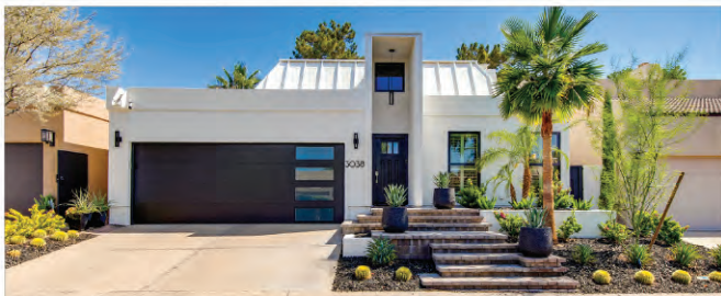
JUST LISTED IN COLONY BILTMORE 3038 E Stella Ln, Phoenix, AZ 85016