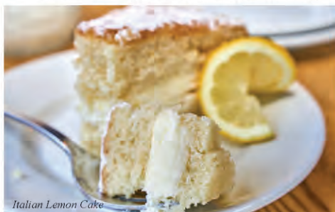
Italian Lemon Cake