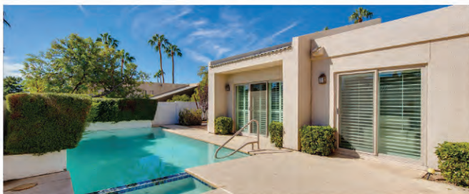
JUST SOLD IN COLONY BILTMORE 3045 E Marlette Ave | Represented the Seller