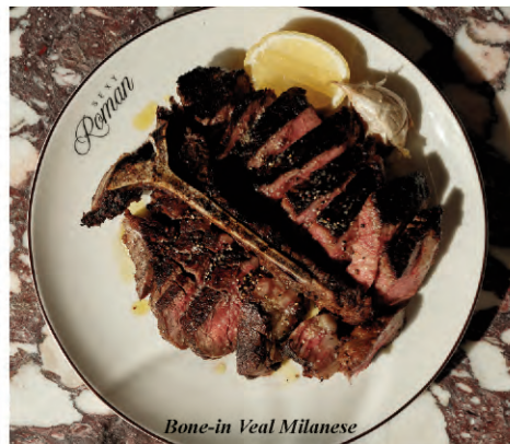
Bone-in Veal Milanese