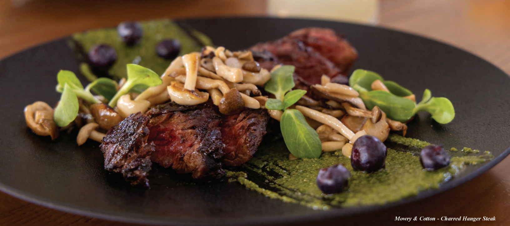
Mowry & Cotton - Charred Hanger Steak