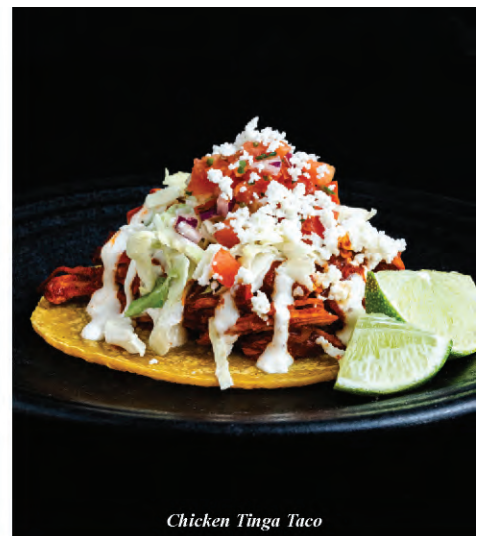
Chicken Tinga Taco