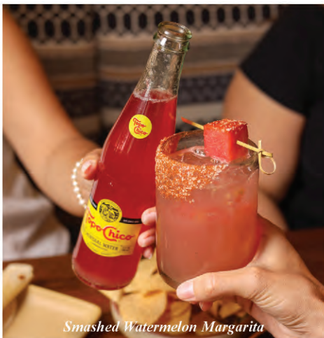
Smashed Watermelon Margarita