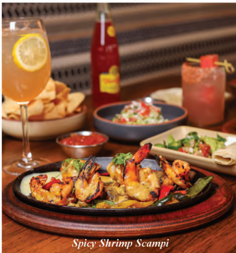
Spicy Shrimp Scampi

For more information and to view the full menu, visit blancococinacantina.com . ❖