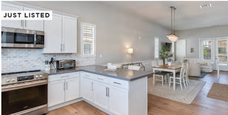
4438 N 27th St #27, Phoenix, AZ 85016 3 Bed | 3.5 Bath | ROSEDALE RESIDENCES