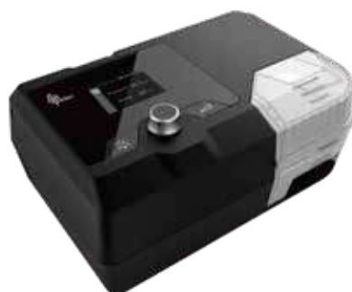
Auto CPAP System G2S A20