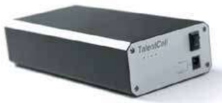
Power Bank (D1402)