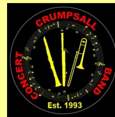
Volume 2 Issue 9 29 th May 2020