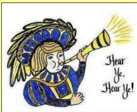
'Hark the CCB Herald' Thank you for the Music