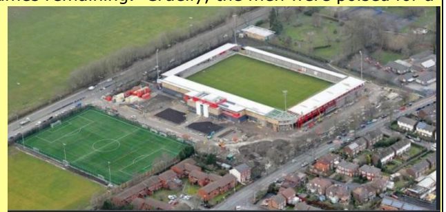
Aerial view Broadhurst Park: West Stand- top edge, backing onto Lightbourne Road

FOR FURTHER DETAILS & INFORMATION: Please visit www.fc-utd.co.uk