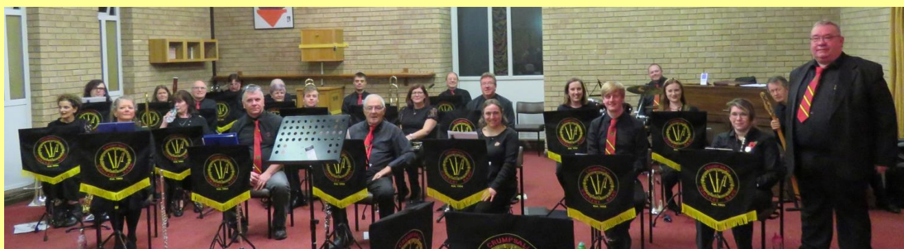
The band, in all our splendour, entertain an appreciative audience at our Autumn concert; Methodist Church Crumpsall