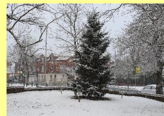
Pic top right: The Crumpsall Christmas Tree looking the part on 28 th Nov ahead of the light switch on at MCC this coming Thursday, 2nd December.