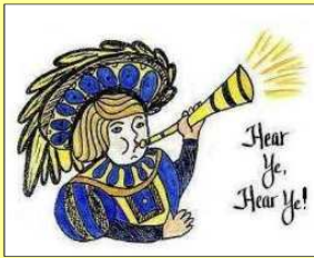
'Hark the Herald' Festive Season 2019/2020