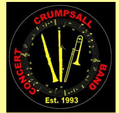
Volume 2 Issue 4 11 th December 2019