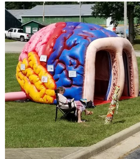
A giant walk-in brain allowed visitors to explore the causes and effects of dementia.

Orange County's first-ever Community Connect event was held September 22 at the Orange County Community Building and included free lunch, a blood drive, free health screenings, and free flu vaccines, among other free services and information. Attendees could enjoy free breakout sessions, eye and oral assessments, HIV/hepatitis screenings, information on