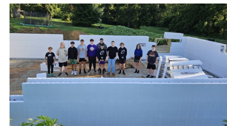
Building trades class members pose in the foundation of the home they are currently building.

Query, with a check to purchase 12 hammers and receive 3 free ones for the building trades class.