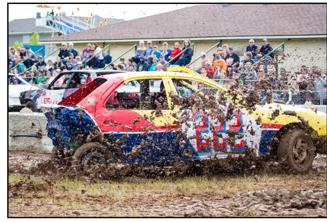
The rain provided the perfect terrain for cars to splash mud around during the derby.