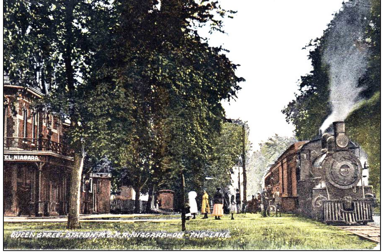
An illustration of the old train that once passed through downtown Niagara-on-the-Lake.

Most of the cargo would be shipped during the summer, comprising of peaches, cherries and other delicate fruits grown in the region, while the passengers mainly consisted of business men from Buffalo, anxious to tap into the lucrative Toronto markets. Tourists also used the steam boats to take their summer vacations. Once unloaded, the mighty steam locomotive would then be moved onto a turntable where a rotating bridge allowed the engine to be turned around to be loaded again for its return journey. If there were any problems with the