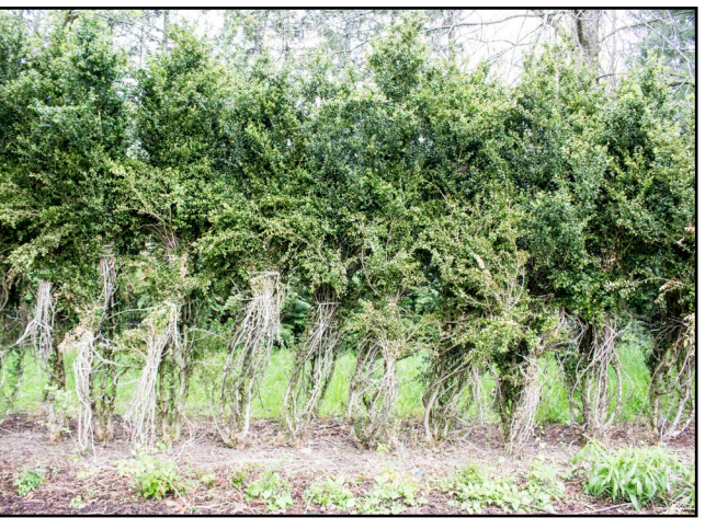
A large boxwood hedge is tied up so it can be safely transplanted.