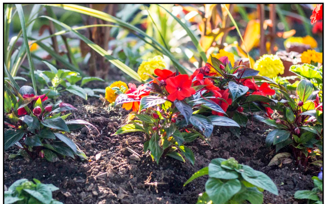
Flowers along Queen St. in Old Town.