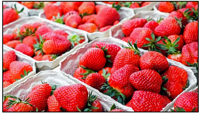
There will be no shortage of strawberries at the annual Strawberry Festival in Niagara-on-the-Lake June 16.

The 35th annual Strawberry Festival in Niagara-onthe-Lake returns to St. Andrew's Presbyterian Church on June 16.