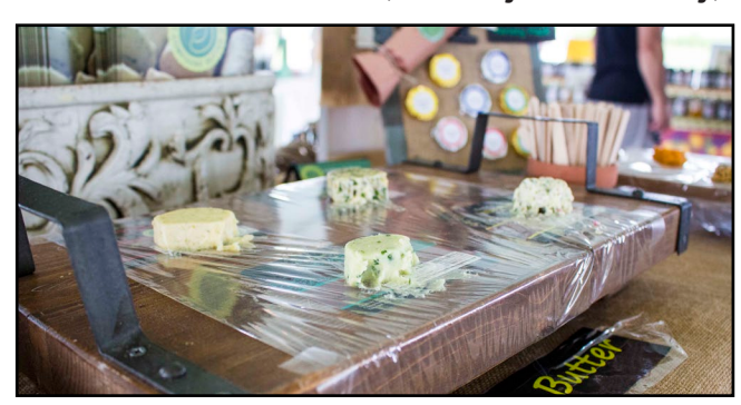
Market-goers were able to sample Lindsay's gourmet butters, including blue cheese chive, roasted garlic, lemon caper, Latin spiced and a variety of sweet butters.

Local resident Paul Staz, who was at the market with