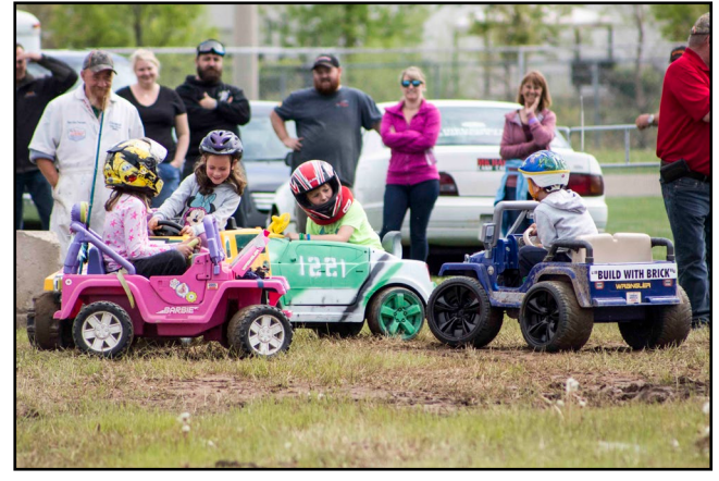
The children's derby kicked off the mud-fuelled frenzy on the Saturday of the Virgil Stampede.