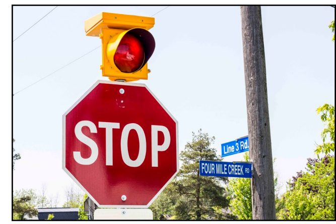
A stop sign on Line 3 hasn't been enough to prevent multiple collisions at the intersection of Line 3 Rd. and Four Mile Creek Rd. in Virgil.

the signs were uncovered to talk to neighbours and see how traffic was responding, said it's about time something was done at the corner.