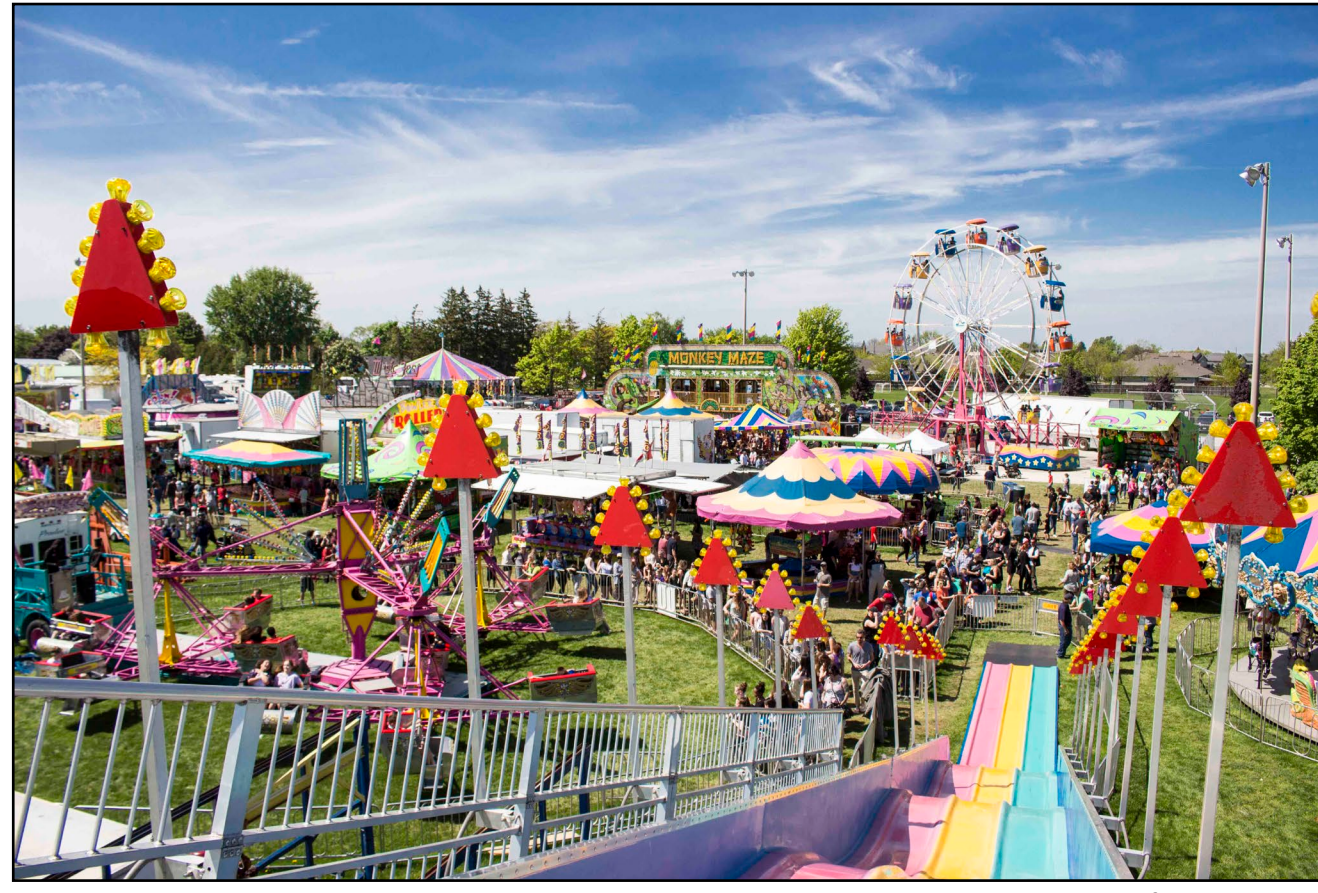
The 52nd annual Virgil Stampede took over Centennial Sports Park during a Victoria Day Long Weekend filled with rides, games, barbecues and family fun.