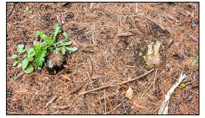
A cedar stump (left) and a boxwood stump (right). Nine boxwood stumps can be counted near a protected boxwood hedge.