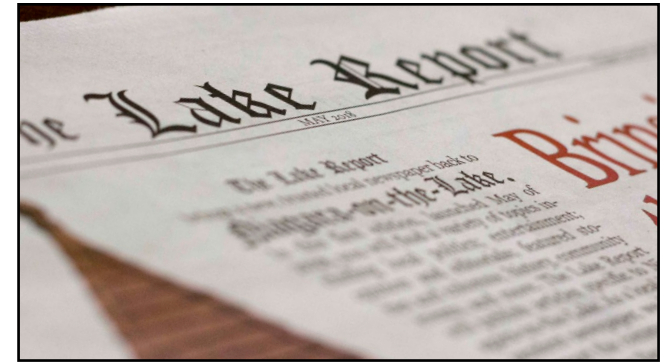
The Lake Report will be publishing bi-weekly starting this June.