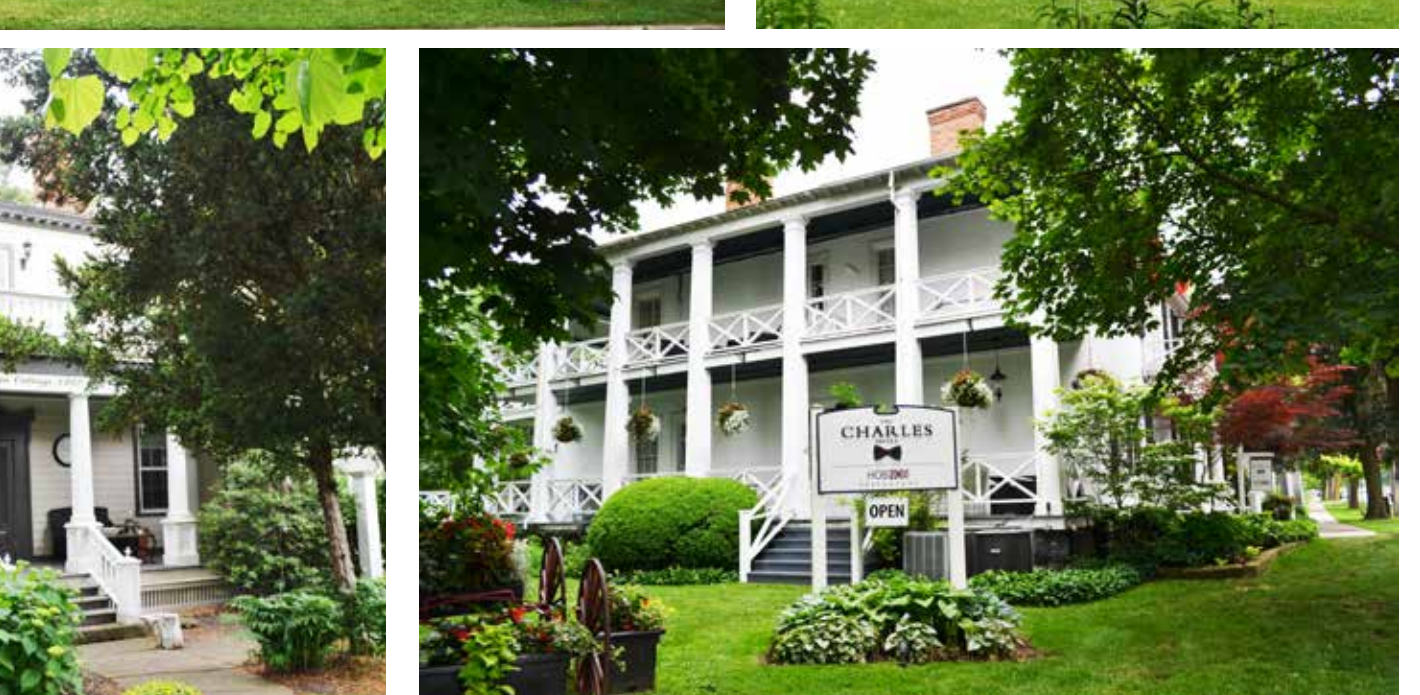
Clockwise from top left: 175 Queen St., 184 Queen St., 187 Queen St. - Roslyn Cottage, 209 Queen St.-Charles Inn.

to travel to St. Catharines for surgeries.