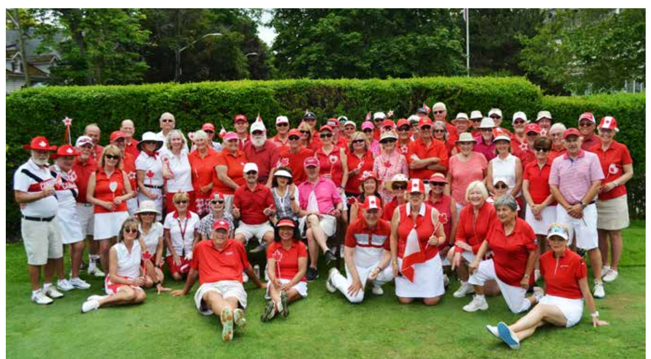
Canada Day Couples. KEVIN MACLEAN