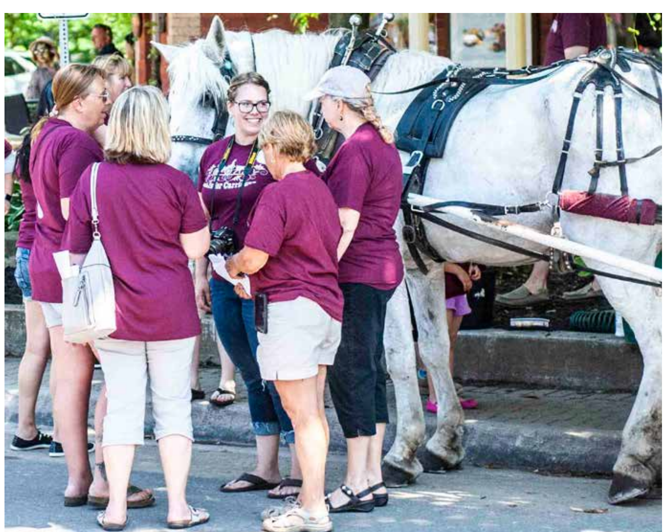
Residents come together over support for NOTL's horse-drawn carriages and local businesses in the wake of animal rights activists.