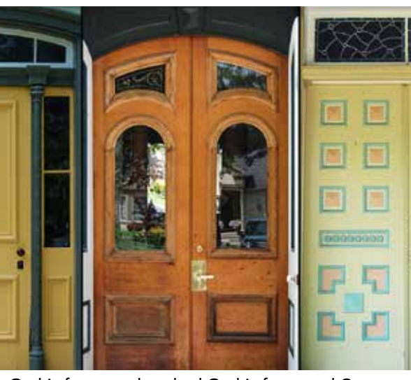
Early Gothic four-panel, arched Gothic fancy and Queen Anne decorated doors. BRIAN MARSHALL

While the classic six-panel door (and its somewhat less expensive five-panel variant) held sway over the houses of the first half of the 18th century, the advent of the Gothic Revival, aided and abetted by later Itali-