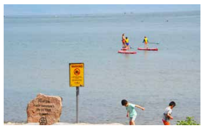
Paddle boarders float offshore Tuesday, while a sign near Queen's Royal Beach warns that the water might be unsafe for swimming.

This summer's water quality data is supplied to the agencies participating in the Remedial Action Plan (the town, regional public health, environment ministry and