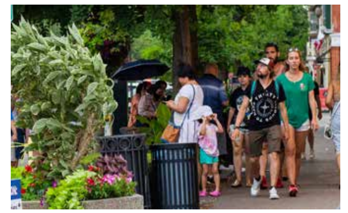
Queen Street strollers on the weekend, without a mask in sight.

While I applaud the NOTL council on this issue, what took you so long? It's not as though we have not known for some time that the most effective defence against the virus is a face covering and we are in the epicentre of tourism in Ontario. Yet it took until