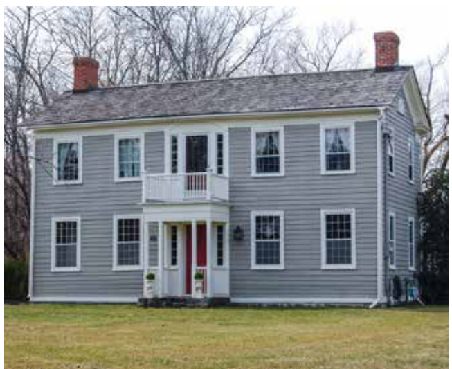
1805 Clement House.

Now, the Town of Niagara (a.k.a. NOTL's old town) was a pretty small place at the time. In fact, Plan V of Niagara drawn in 1810 identifies the location of only about 125 structures not attached to Fort George. So,