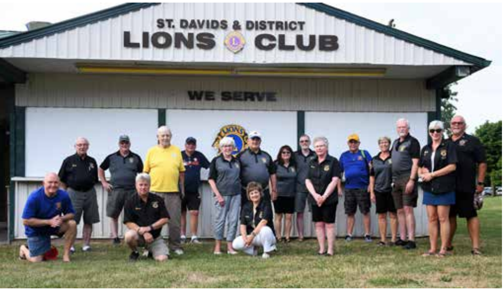
St. Davids Lions Club members stand at the pavilion where they will hold the drive-thru barbecue.

"It'll basically be like a drive-thru. They can drive past the hall, come up and drive behind the hall and through the field to the back