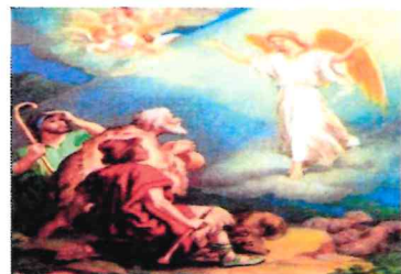
9 Then an angel of the Lord stood before them