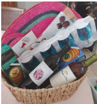
Figure 2 Casual Wine: 2 bottles of wine, crackers, chocolate, 4 placemats and 4 wine glasses.