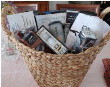
Figure 1, Golf for 4 at The Majors with cart, golf balls, Arnold Palmer drinks, towel, and crackers

FRWA donated two raffle baskets to the Brevard Federated Republican Women's Biennial Honor the Veterans and Military Dinner and Fundraising Auction held Saturday, March 20, 2021. Thanks to those who donated items for the baskets.