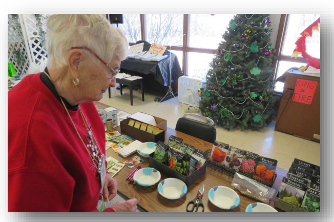
more on club website: https://antiochgardenclub.org/agc-news