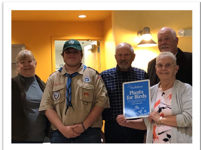
Antioch Garden Club was recognized at the Oct. 12 Antioch Township meeting by the Lake County Audubon Society for the club's contributions to bird conservation.