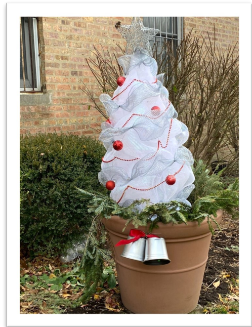
This is one of the beautiful trees the Horticulture Committee recently created in the Mini Park containers.