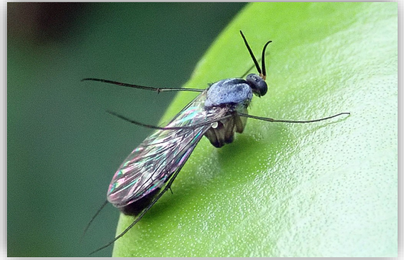
Fungus gnats can be controlled with yellow sticky traps. Keeping plants dry helps prevent gnat eggs from hatching.

G reetings all and happy Autumn! By now plants should have been moved inside to overwinter. Occasionally we also may bring in insects with them. Not to worry.