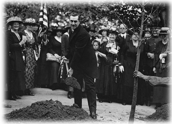
Secretary of Agriculture Edwin T. Meredith and the District Federation of Women’s Clubs plants a tree in honor of J. Sterling Morton in May 1920.