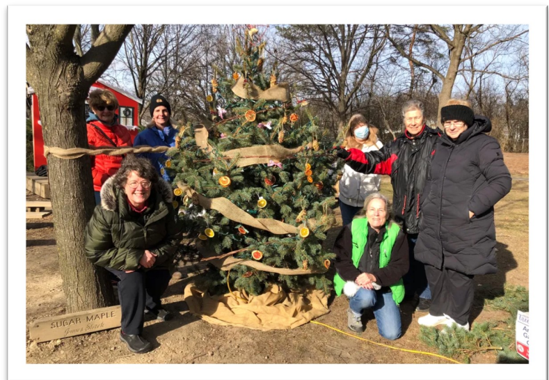
A team of members decorated a tree for the village's Festival of Trees at the Hiram Buttrick Sawmill.