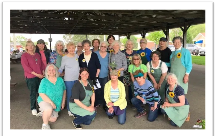
2022 Plant Sale Crew