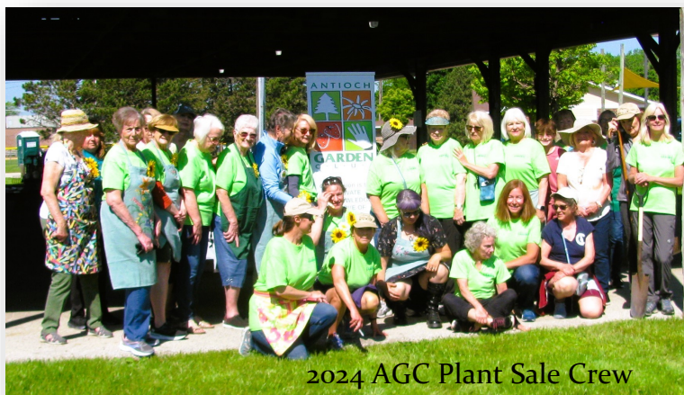
2024 AGC Plant Sale Crew