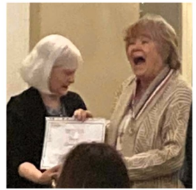
Antioch has the happiest president!

Following the lunch was a floral design artist who wowed everyone with the ease with which he created his masterpieces.