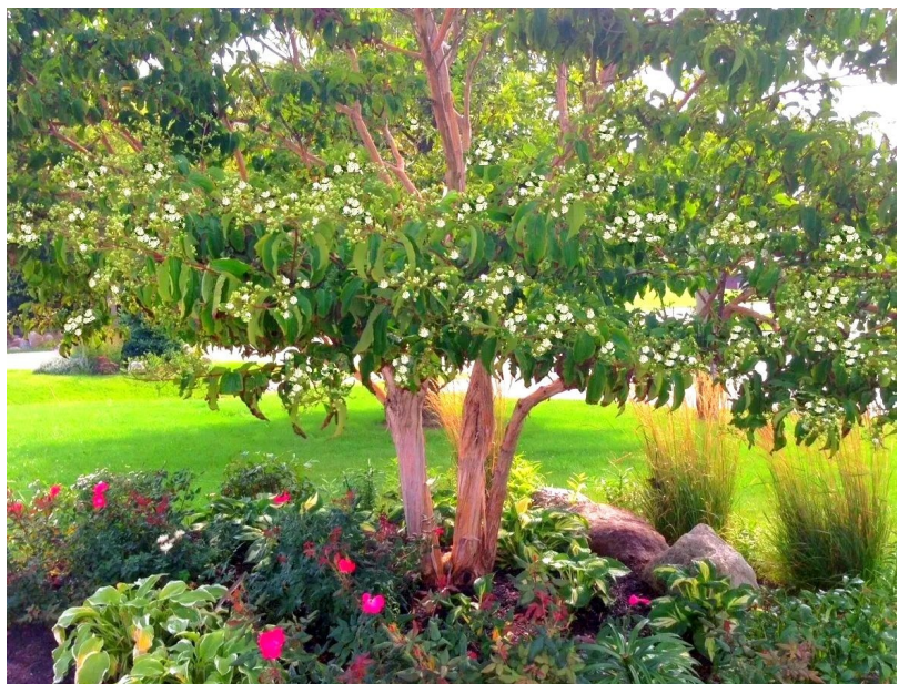
Seven Son Flower Tree Garden, Antioch