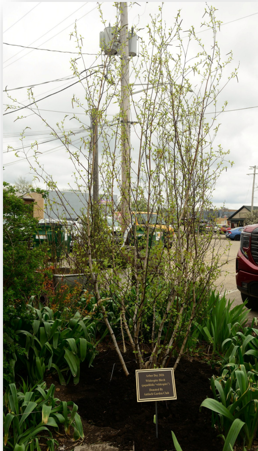
The new tree is in place in all its glory! Below, many club members came to the event.