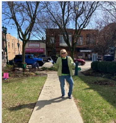
The results are in: Peony frame 1 Gardeners 0