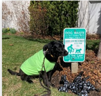
Shirley Mae volunteered to clean up after canine visitors to the Mini Park. Her disclaimer: "It's not mine!"