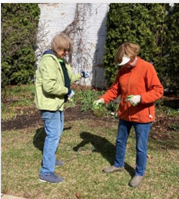
How many gardeners does it take to assemble a peony frame??