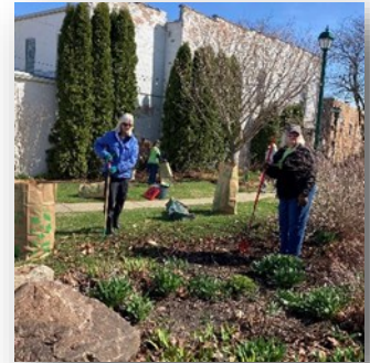
Yes indeed, progress is being made here, folks.