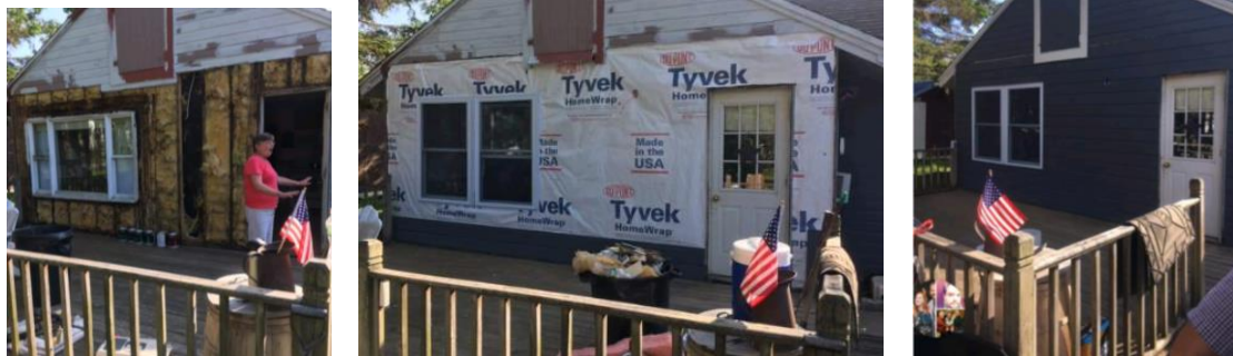
Extensive and unplanned repairs were completed at the 1 st home.

The largest of the jobs was originally intended to incorporate replacing the wood exterior on a home, then scraping and painting the entire house. Once the team began removing the exterior boards, it was discovered that the house had much more extensive damage than originally thought. The team was called upon to replace 2 windows, including the window framing and repairing the entry door. This location had varying groups of Holy Trinity volunteers on site for 4 days. The completed job can be seen below, in the far-right photo.