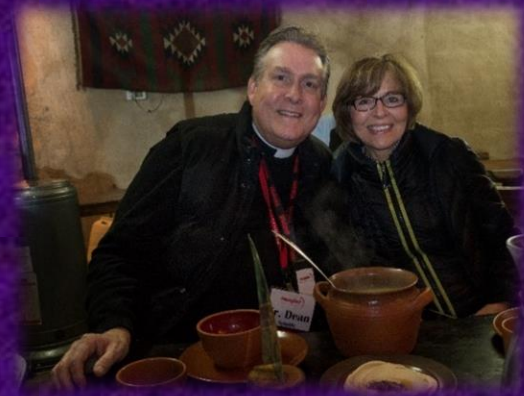
Lunch in Nazareth while on pilgrimage in Israel

Are you facing some difficult challenges in your life today? "May the God of hope fill you with all joy and peace as you trust in him, so that you may overflow with hope by the power of the Holy Spirit". Romans 15:13