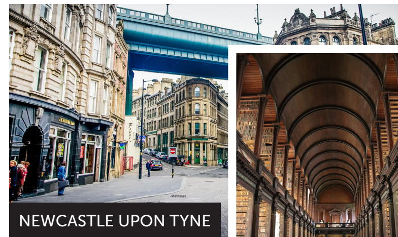
NEWCASTLE UPON TYNE

Today we transfer to Manchester Airport for our flight home. We return to the U.S. same day.