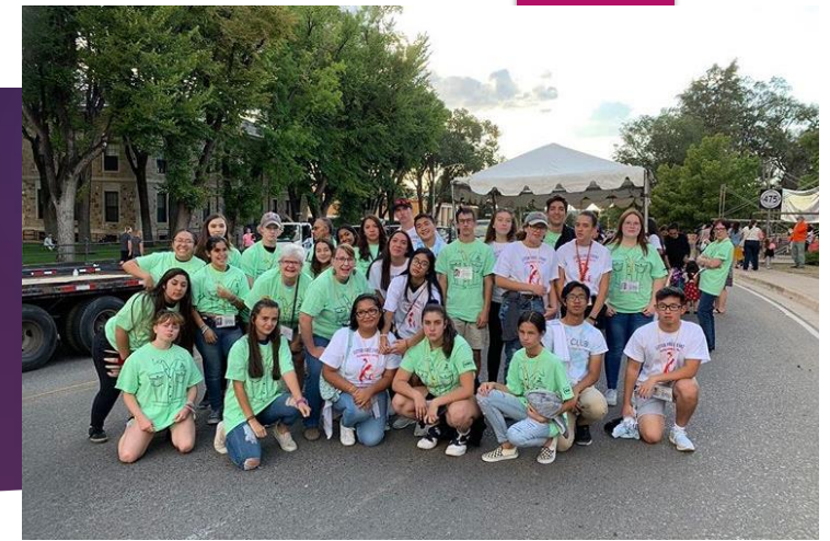
Corrales Kiwanis- Chibola Key Club