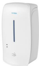
Hand sanitizer dispenser model HSD-201740