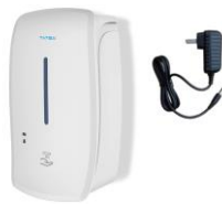
Optional AC / DC adaptor