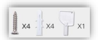
Mounting kits & key