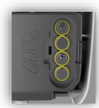
4 x LR6 / AA batteries