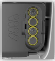
4 x LR6 / AA batteries