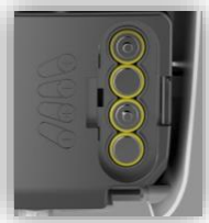
4 x LR6 / AA batteries