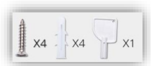
Mounting kits & key