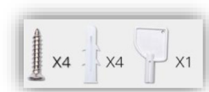
Mounting kits & key