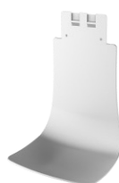
Tray item #: HSD-2017-T