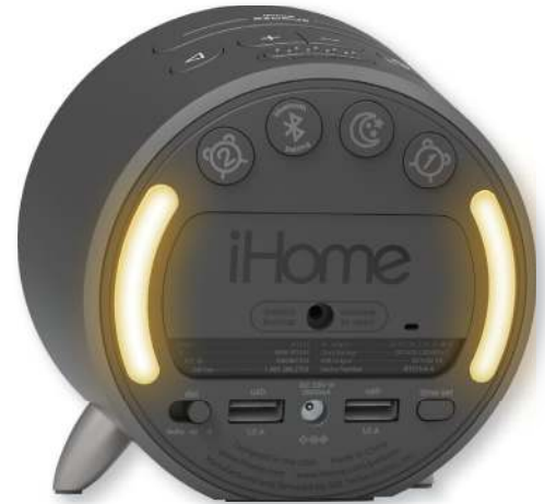
Ambient Light and 2 USB Charging Ports