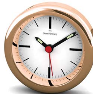
Luminous hands H58RSTAT