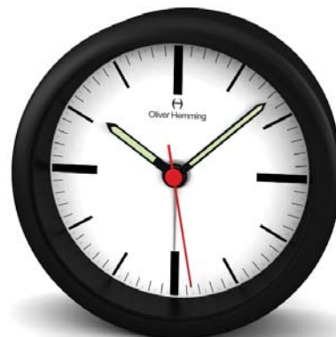
Luminous hands HX80BSTAT