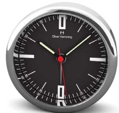
Luminous hands HX80S45B