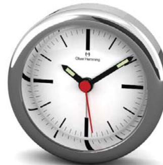
Luminous hands H58SSTAT