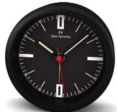
Luminous hands HX8B45B