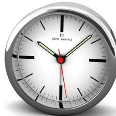
Luminous hands HX80SSTAT