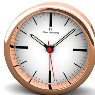
Luminous hands HX80RSTAT