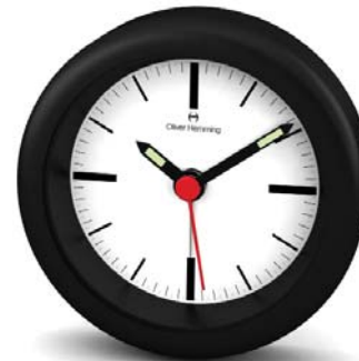
Luminous hands H58BSTAT