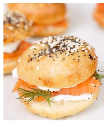
mini bagel + lox with chive garlic cream cheese