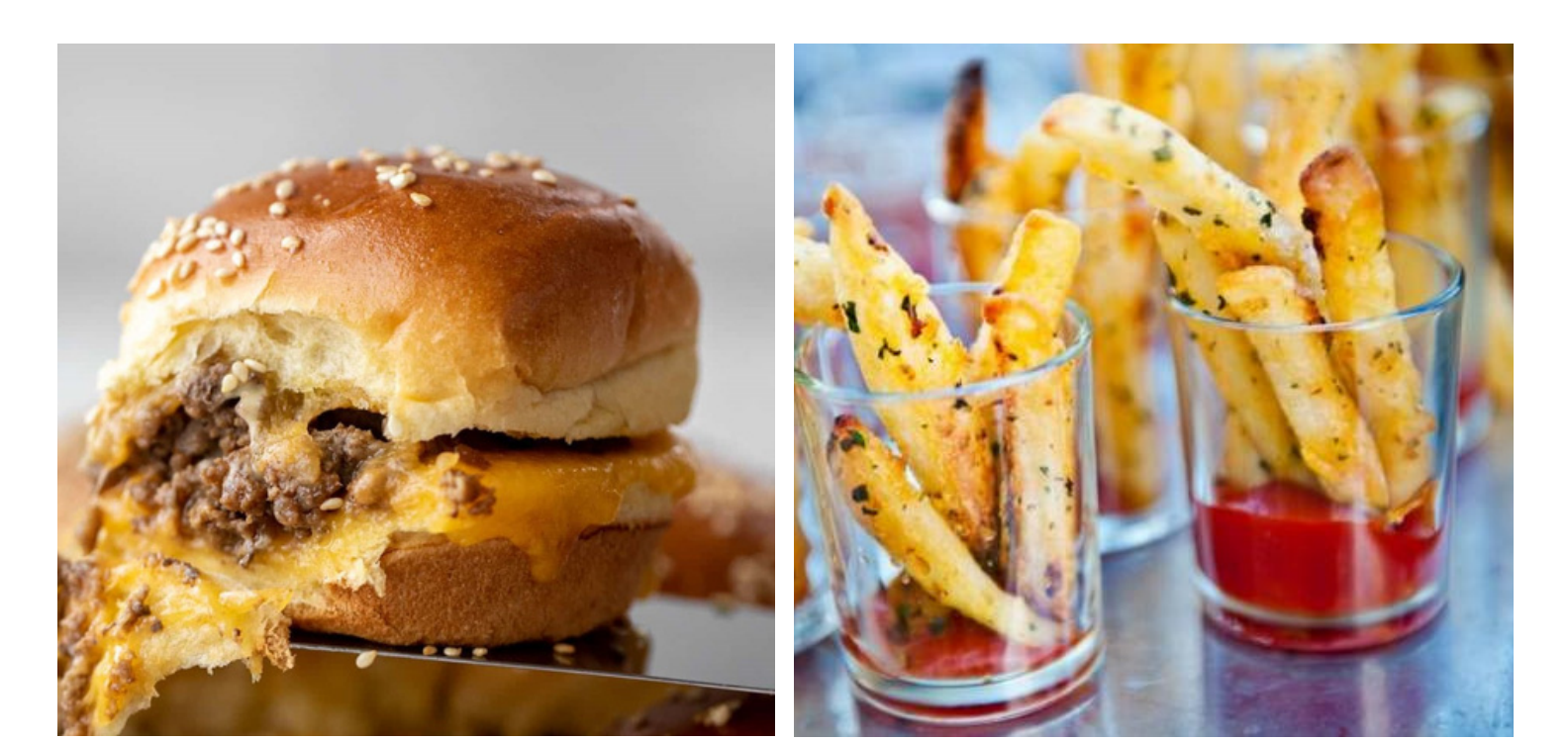
mini cheeseburgers in pardise

truffle or garlic + parmesan french fry shooters