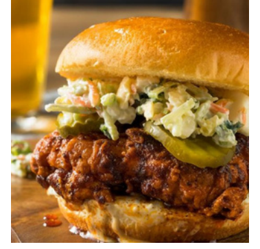
siracha + honey chicken sliders