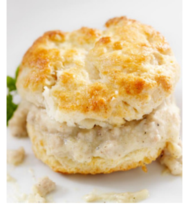
southern sausage + gravy biscuits