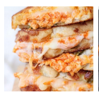
buffalo chicken + grilled cheese