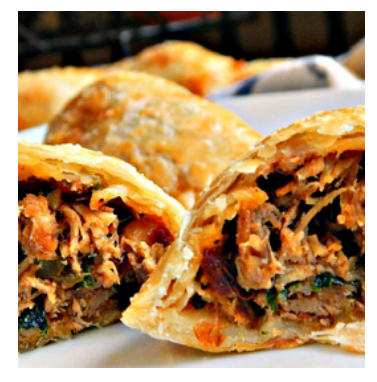
chipolte pulled chicken empanadas