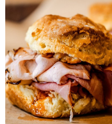
peach glazed ham + swiss cheese