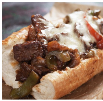
bite sized philly cheesesteak