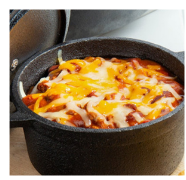
creamy mac n cheese "chili pots"