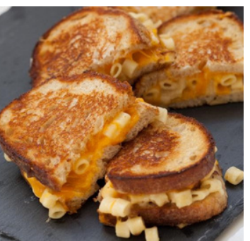
grilled mac n cheese sandwiches