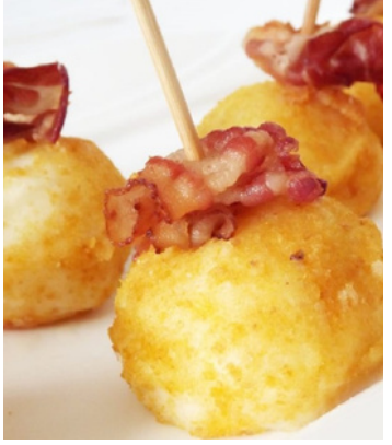
tators + candied bacon