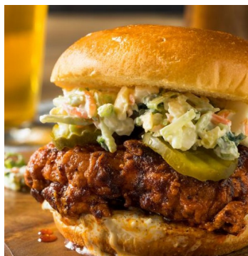
siracha + honey chicken sliders