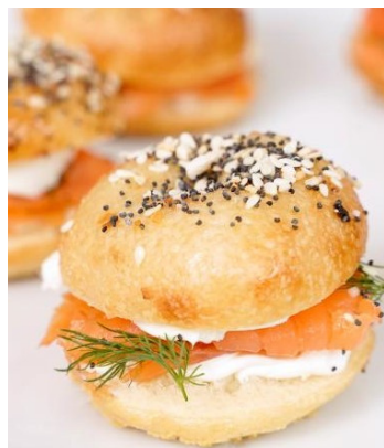
mini bagel + lox with chive garlic cream cheese