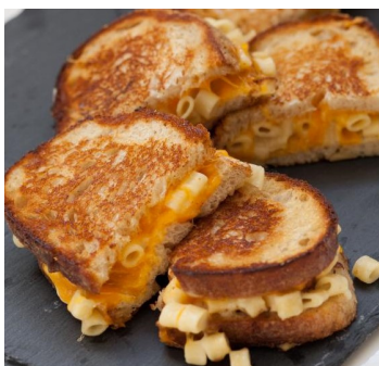
grilled mac n cheese sandwiches