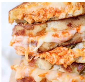
buffalo chicken + grilled cheese