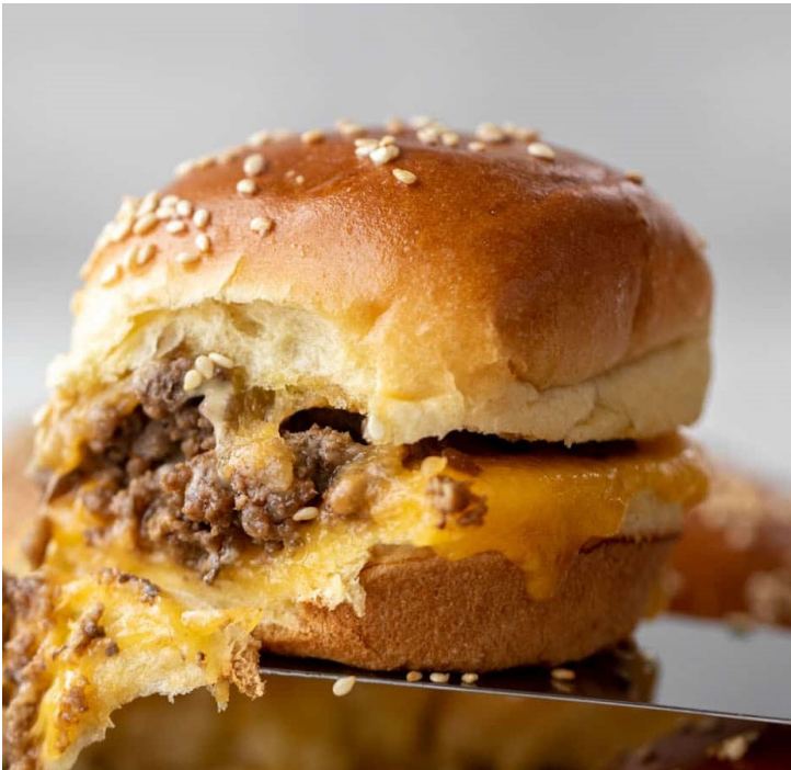
mini cheeseburgers in paradise