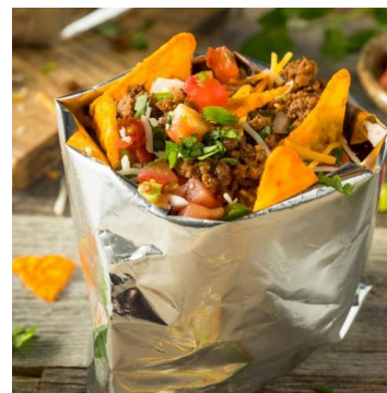
mini tacos totes