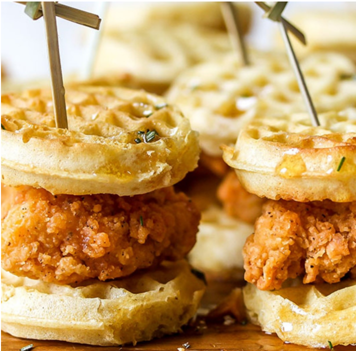
chicken waffle + bourbon glaze sliders