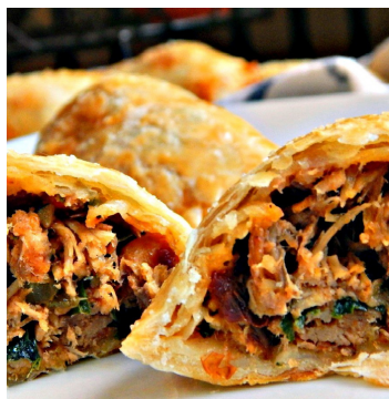
chipotle pulled chicken empanadas