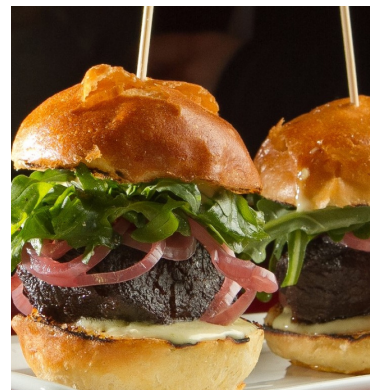
short rib + horseradish cream fraiche sliders