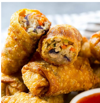
chicken or vegetarian egg rolls + tropical jam