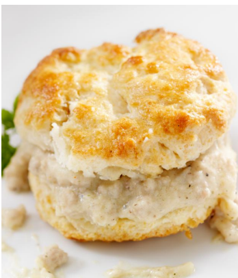
southern sausage + gravy biscuits