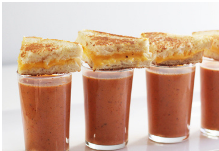
grilled cheese + warm tomato soup