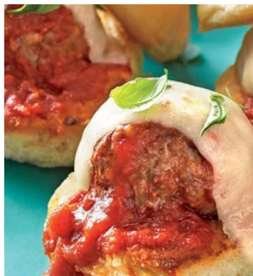
meatball + provolone sliders