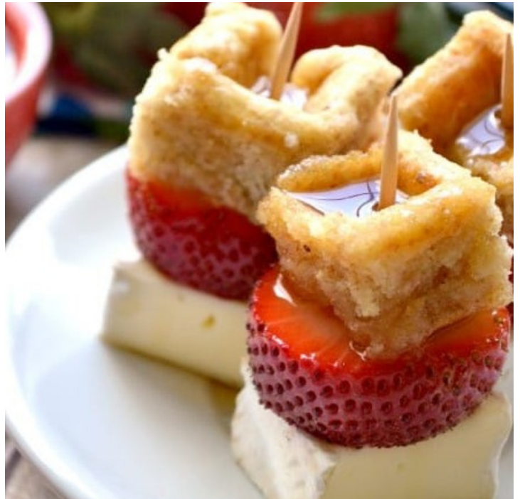
berry + brie waffle bites