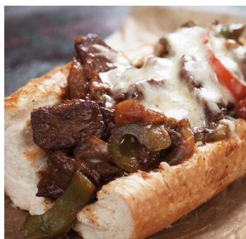
bite sized philly cheesesteak