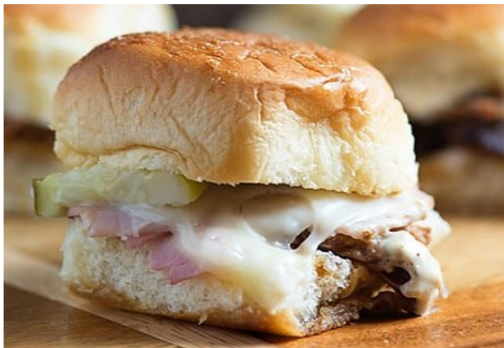
mini cuban sandwiches