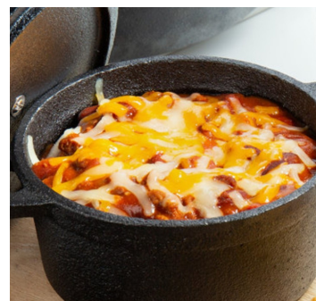
creamy mac n cheese "chili pots"