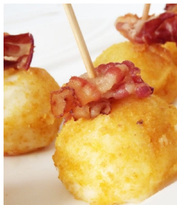
tators + candied bacon