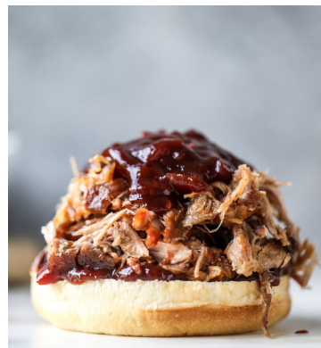
chipotle cherry glazed pulled pork sliders