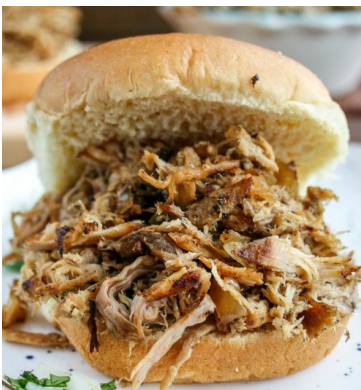
pork carnitas slider