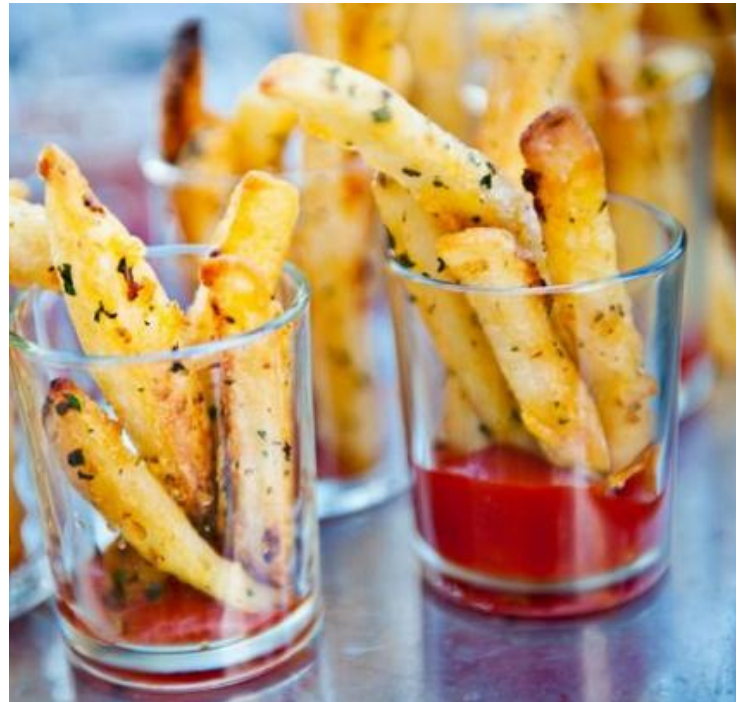
truffle or garlic + parmesan french fry shooters