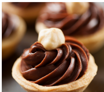
double fudge chocolate