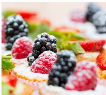
berry bavarian cream