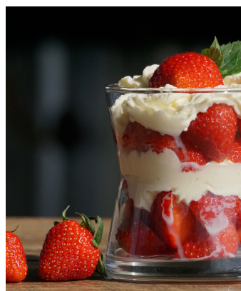
berry + white chocolate

Perfect for a grab-and-go treat and then back to the dancing!