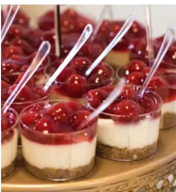
family style servings