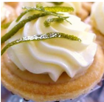
key lime tart

LOVE PIE? Our tarts can also be served as part of a dessert station for more than one bite of deliciousness.