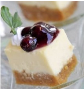
blueberry + white chocolate

Family-style cheesecake options are available for all who just love cheesecake!