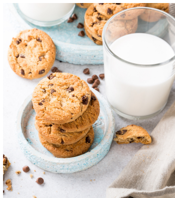
milk + cookies