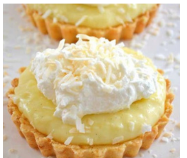
banana coconut cream