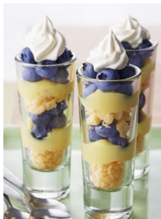
berry lemon mist