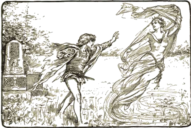
THE FOUNTAIN OF MERLIN.

seemed so hideously ugly. He could not bear to look at her. With the deepest disgust he turned away, and remounted his good steed; and then, as fast as the fleet-footed Bayard could carry him, he hastened out of the wood of Ardennes, and back to the court of the king.