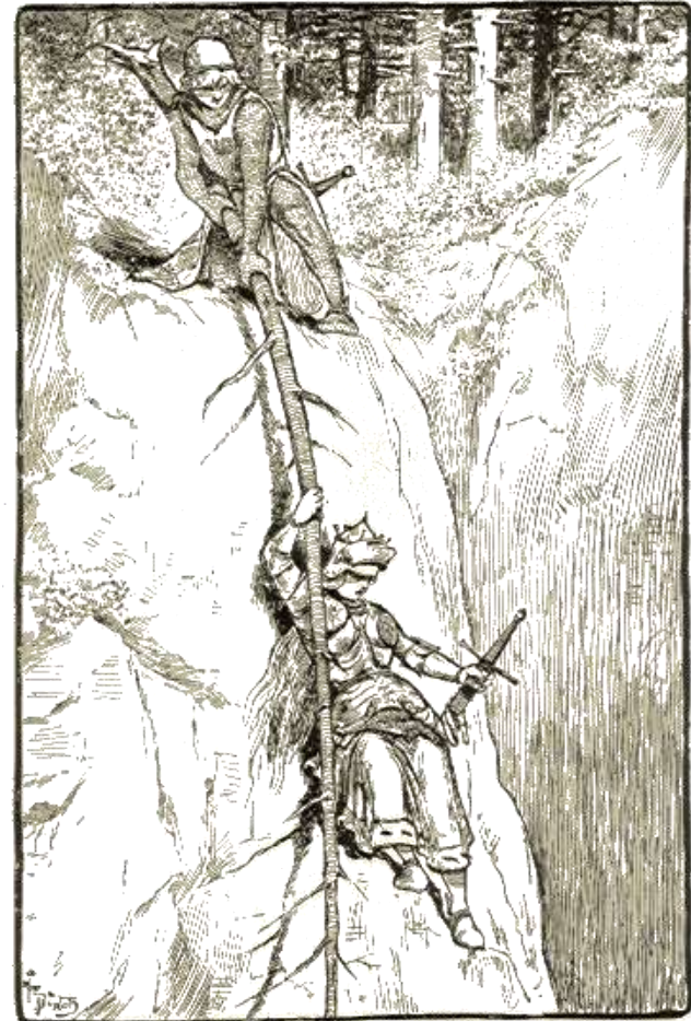
BRADAMANT AND PINABEL.

the branch, and plunged the helpless Bradamant down to the bottom of the great well. Had not the stout elm branch broken her fall, the warrior maiden would have been killed outright. As it was, she lay for some time, stunned and helpless, upon the hard stone floor; while the wretched Pinabel, chuckling with delight, mounted his steed and rode away.