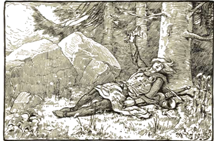
THE DEATH OF ROLAND.

"Friend Roland," said he, "worthiest of men, bravest of warriors, noblest of all my knights, what shall I say when they in France shall ask news of thee? I shall tell them that thou art dead in Spain. With great sorrow shall I hold my realm from this time on. Every day I shall weep and bewail thee, and wish that my life, too, were ended."