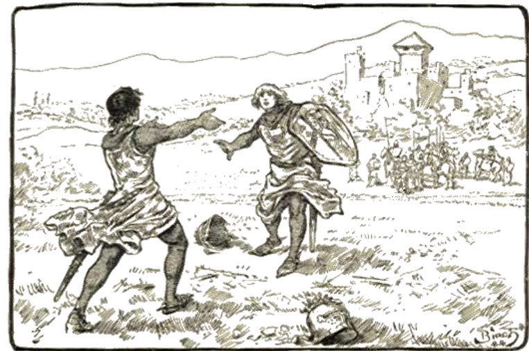
"A ROLAND FOR AN OLIVER."

with greater skill; never was there a nobler combat. The sun rose high in the heavens, and the noontide hour came; and still each knight stood firmly in his place, thrusting and parrying, striking and warding, and gaining no vantage over his foe. After a time, however, the patience of the red-plumed knight gave out. He grew furious. He was anxious to bring the combat to an end. He struck savagely at Roland; but the stroke was skillfully warded, and Haultclear snapped short off near the handle. At the same time Durandal, coming down with the force of a thunderbolt, buried itself so deeply in the shield of the red-plumed knight, that Roland could not withdraw it.