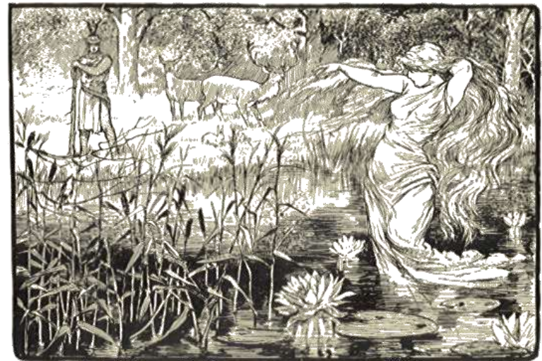
THE GARDENS OF FALERINA.

He opened it, and looked at the map. There was nothing said about the place where Hector's arms were hidden. But he saw that on the south there was a gate which was always open. Between the gate and the palace was a large lake; and in the lake, the book said, there was a siren, whose song charmed all passers-by, and had caused the death of many a brave knight.