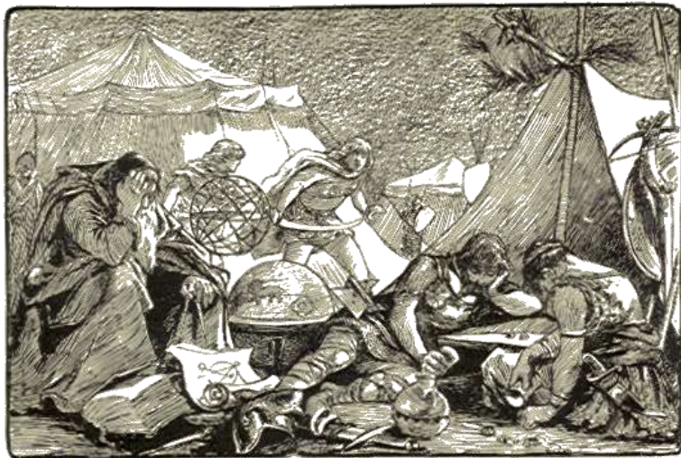
CLORIDAN AND MEDORO.

On that sad night which followed the day of battle, the two young men, with others of the Moorish host, stood guard before the camp; and every word they spoke was of their lost lord Dardinel, whom they bewailed and mourned through the earlier watches of the night.