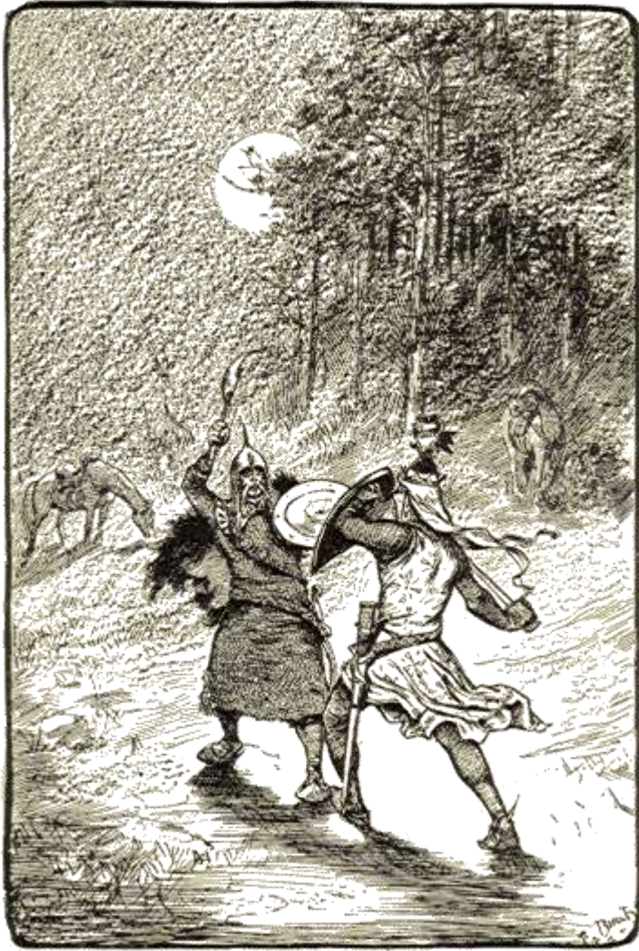
THE COMBAT AT MIDNIGHT.

"Pagan and foe, though thou wert," murmured Roland, "yet thou wert a man, and a most worthy knight!"