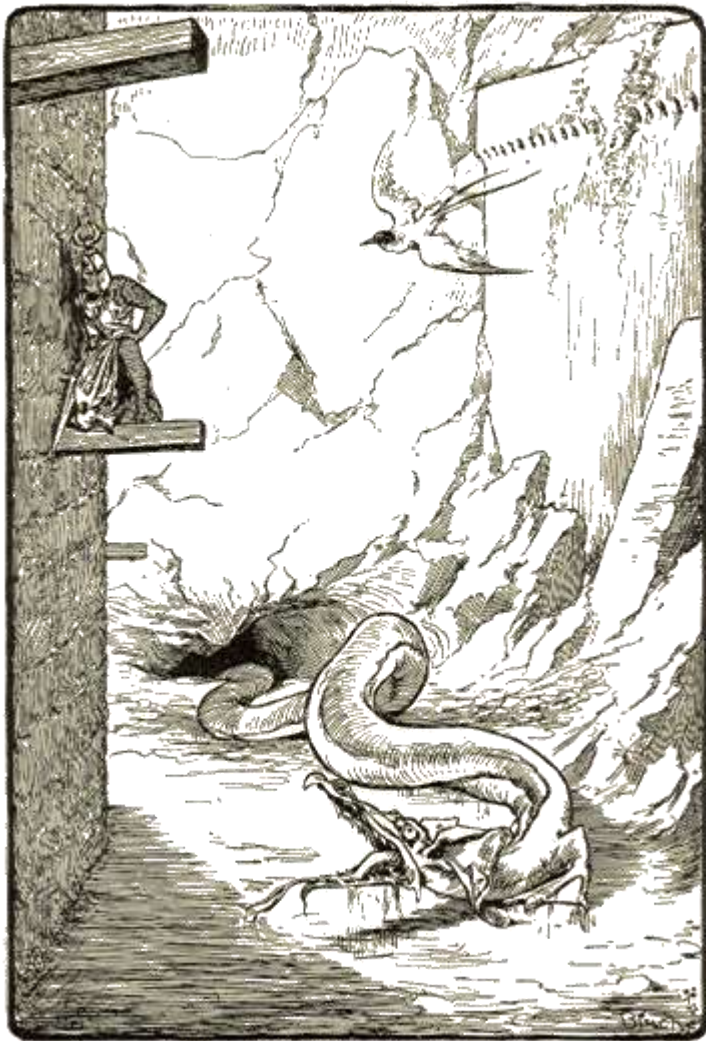
IN THE DRAGON'S DEN.

"Most worthy knight," said she, "fortune comes always to the help of the brave. Now here are a ball of wax and a strong net, which you may use as your good sense may direct. But you must never forget that this aid has been sent you by the Princess Angelica of Cathay."