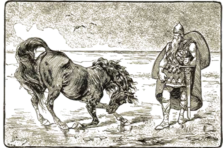
OGIER AND THE HORSE PAPIILLON.

There he was kindly welcomed by Morgan the Fay, the queen of that land. A crown of roses was placed upon his head, and he lost all remembrance of his former life. There, through long years of happiness, he had the companionship of King Arthur and his knights, and of all the great heroes that have ever lived on earth; and he was freed from death and every mortal care. But once on a time he bethought him that he would return to France and visit his friend Charlemagne again. The fairy queen consented, and the sea-goblins carried him back. But every thing was changed. Paris was no longer the city he had once known. He made his way to the palace, and inquired for Charlemagne. Men laughed at him, and told him that Charlemagne had been dead two hundred years, and that Hugues Capet was king of France. The good Dane felt now that the world had no joys for him; and not long afterward he was carried back again to the sweet Vale of Avalon, where he still lives with the blissful company of heroes.