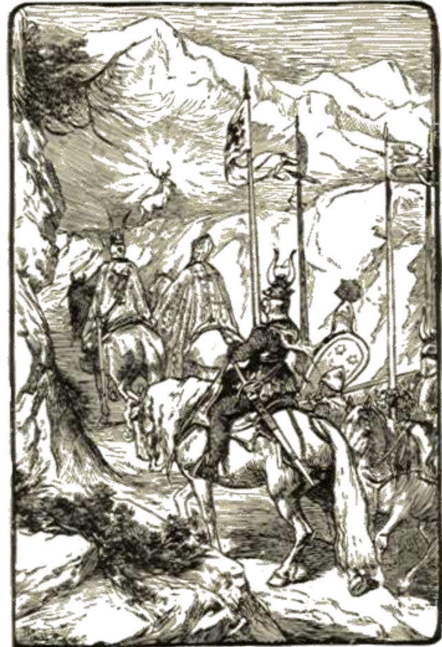
THE WHITE STAG.

"Behold our leader and our hope!" cried Turpin. "Behold the sure-footed guide which the Wonder-king has sent to lead us through narrow ways, and over dangers steeps, to the smiling valleys and fields of Italy! Be only strong and trustful and believing, and a safe way shall open for us, even where there seemed to be no way."