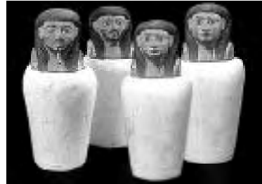
In these Canopic jars the stomach, intestines, liver, and lungs were preserved and stored.

With further ritual words the mummy was again turned on its back. "Then turn," it was said, "thy face to the heavens, as it has been before." There then followed corresponding parts of the ritual and the gilding of the fingernails and toes.