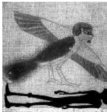
The “ba” or spiritual element was thought to leave the body and move about freely.

From the point of view of historical development, the process of mummification began soon after the transition from the rulership of the gods to that of Pharaohs had begun. That was the time in which the initiates of the Egyptian mysteries perceived the beginning of a new world age with all the measures for the guidance of the culture which were now called for. One such measure was the establishment of the Pharaohs with their dynasties, and the transmission of the divine powers to the human personality of the Pharaoh. The divine was thus transposed into the human realm and thus became subject to error and the wish for power.