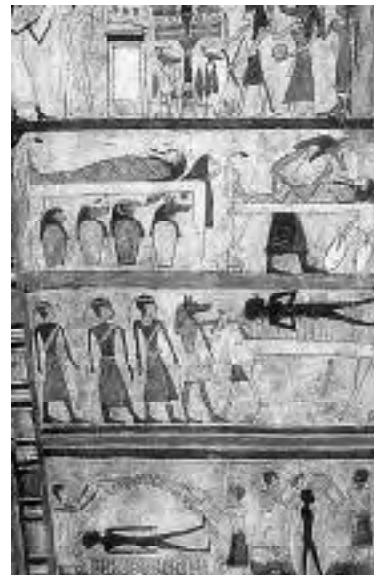
A cartoon depicting the process of mummification which allowed the deceased's spiritual and physical elements to be reunited intact, after death.

The decision to take such extensive and world-significant measures must have been made for particular reasons and then elaborated into the practical details. This decision, not only the fact in itself, is a question which rises up anew when one beholds a mummy. We must acknowledge the fact that the Egyptians, from a certain time on, felt the necessity to maintain the earthly human form in an artificial way. To understand the deeper reasons for this, one must look at the Egyptian world-conception and at the particular relation which the Egyptian had to the earth as a living organism, which was consid-