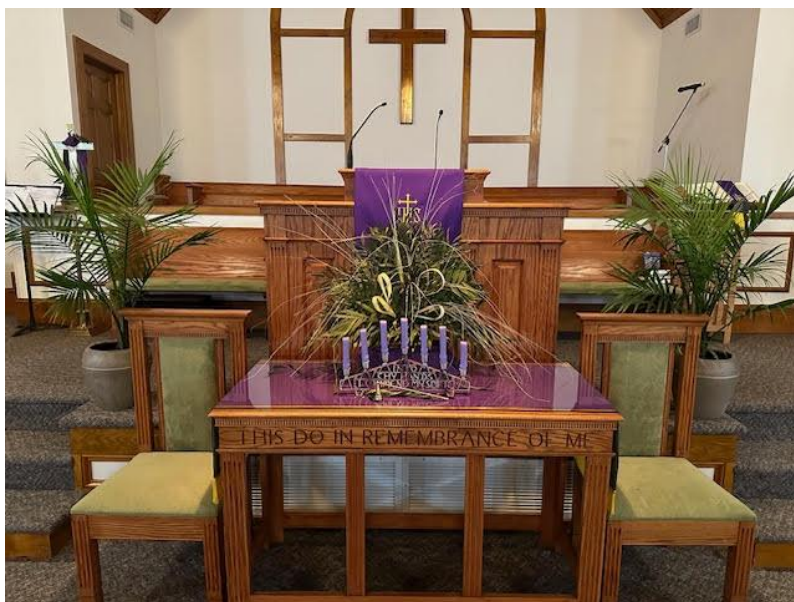
Palm Sunday Altar

Office Hours: 8:30 – 4:30 Tues – Fri, and as needed.