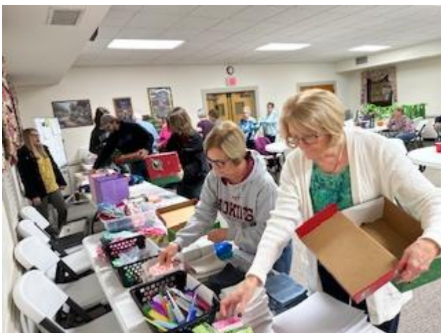
2023 Shoebox Packing