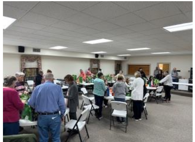
2023 Thanksgiving Meal Packing