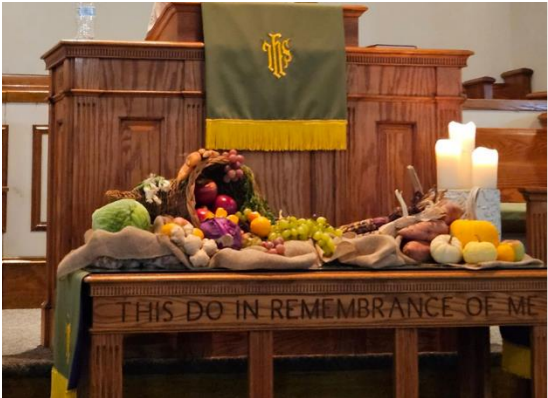
On the altar: Top – Christ the King Sunday Bottom: Thanksgiving Service