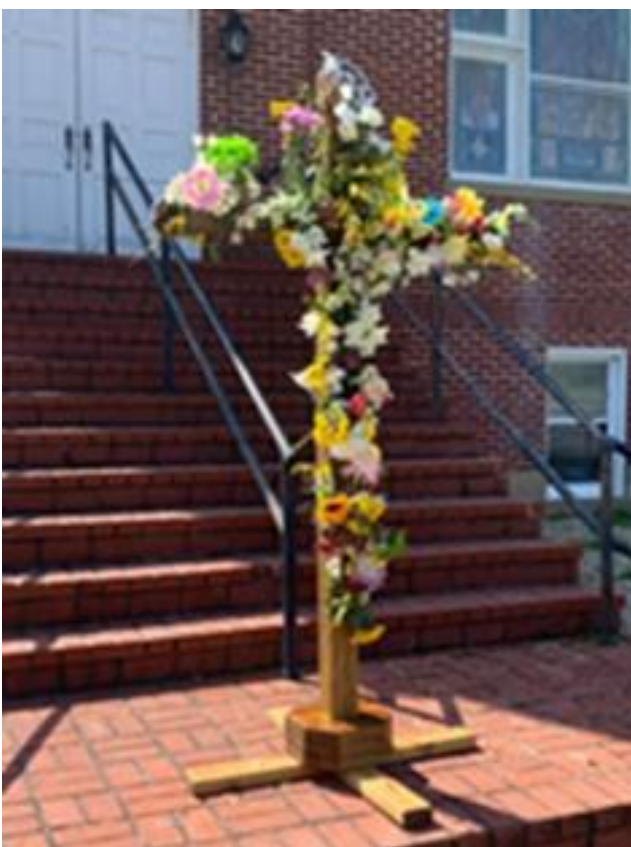
Flowered Cross – Easter

Office Hours: 8:00 – 4:00 Monday – Thursday & As Needed/By Appt