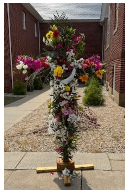
Easter Sunday Flowered Cross