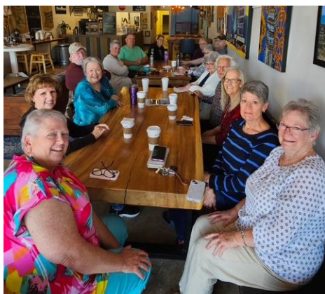
Coffee & Conversation, April 29 at StoreHouse