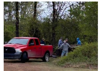
B & G Workday