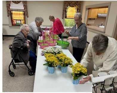
Easter Basket Packing